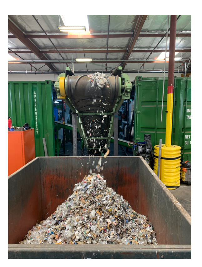
PLACEHOLDER FOR YOUR APPROVED PHOTO AND EXPLANATION

The Project will generate 50 MW of clean and renewable energy on Unguja Island, the largest island in the Zanzibar archipelago and the seat of Zanzibars' semi-autonomous government. It will be comprised of 42.5 MW of solar generation, coupled with Asia's' proprietary Regreen waste-to-energy technology, which will generate the remaining 7.5 MW while consuming and eliminating approximately 300 tons of municipal solid waste daily. The Project will also include a battery energy storage system that is a much needed source of grid stability and a peak power source for the island.