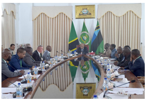
Astra team moving forward in Zanzibar presenting the feasibility study for the Zanzibar Clean and Renewable Energy Park, with opening Power Purchase Agreement remarks.

Accounting/Auditing Firm: Fruci & Associates II, PLLC